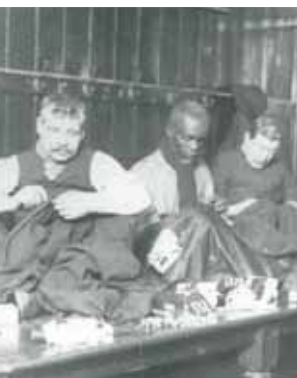
Mission tailors